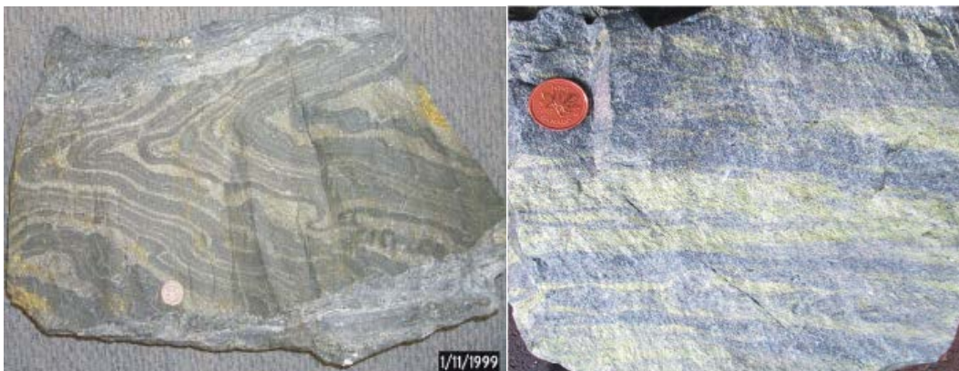
Banded, massive pyrite-chalcopyrite-sphalerite ore from MFO (Chong et al., 2005)

The group will leave Campbell River at 7:40 a.m. and arrive in Departure Bay at 9:40 a.m., in time for the 10:40 a.m. sailing to Horseshoe Bay (West Vancouver). The group can eat lunch on the ferry, and will arrive at Horseshoe Bay at 12:20 p.m. Rental trucks with passengers destined for Whistler will leave the ferry terminal, arriving in Whistler at approximately 2 p.m.