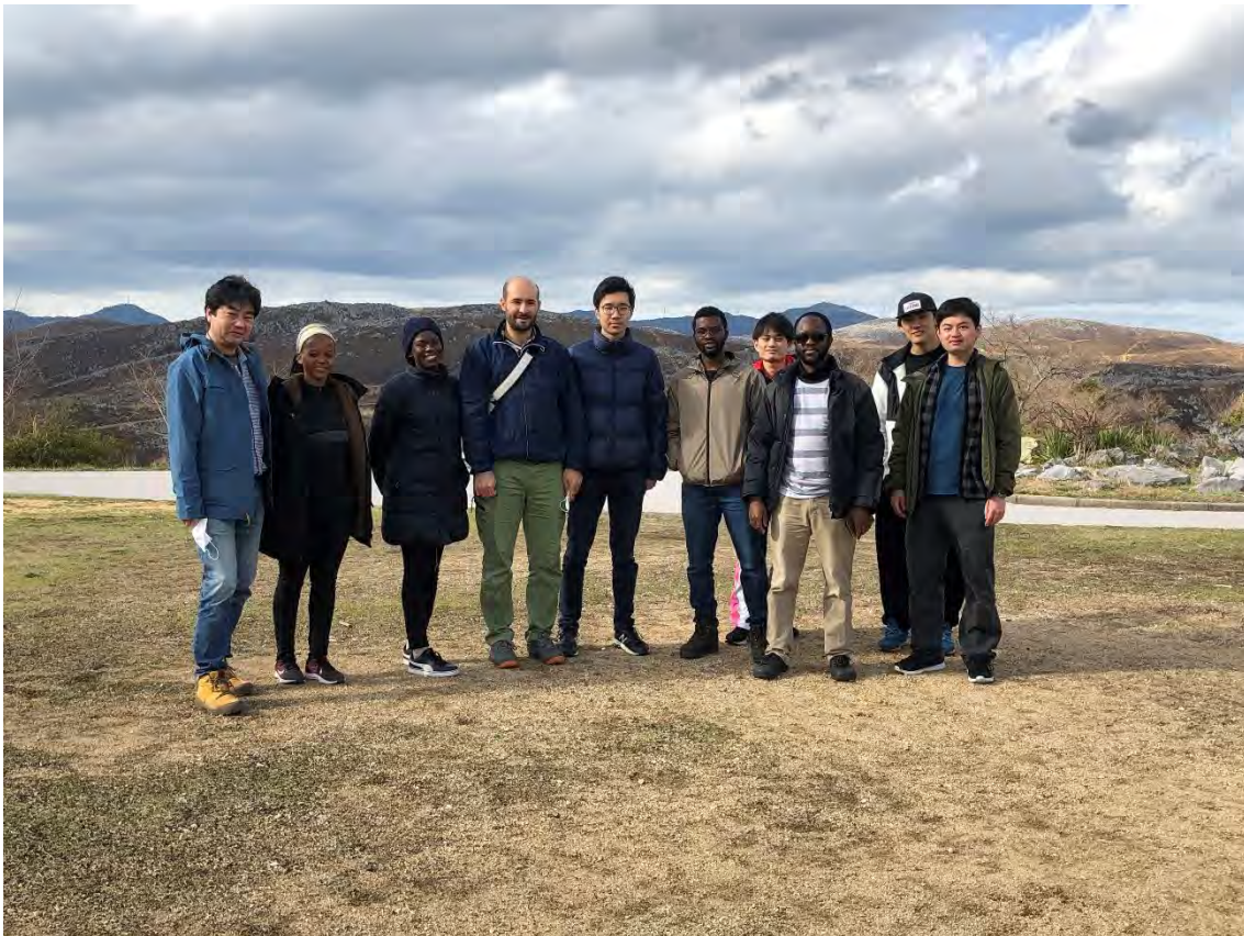
Figure.4 Group photo during the field excursion in Yamaguchi prefecture. Photo was taken in Akiyoshi-dai

Fukuoka prefecture. Tagawa skarn province hosts several skarn deposits related to oxidized, magnetite series granite, and we measured the magnetic susceptibility of the granite by using magnetic susceptibility meter. Through our two field trips, we managed to visit both oxidized, magnetite series granite, reduced, ilmenite series granite and confirmed the relationships between different granite series with different skarn types.