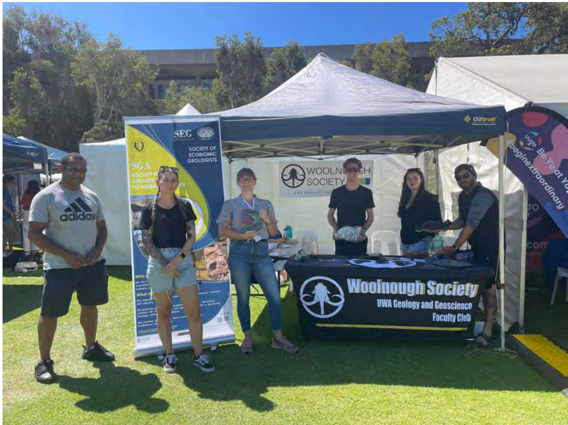
Members of SEG-SCA WA Student Chapter and Woolnough Society collaborating to promote the chapter during the O-Day, held at the University of Western Australia, on the 24 th of Feb 2023.