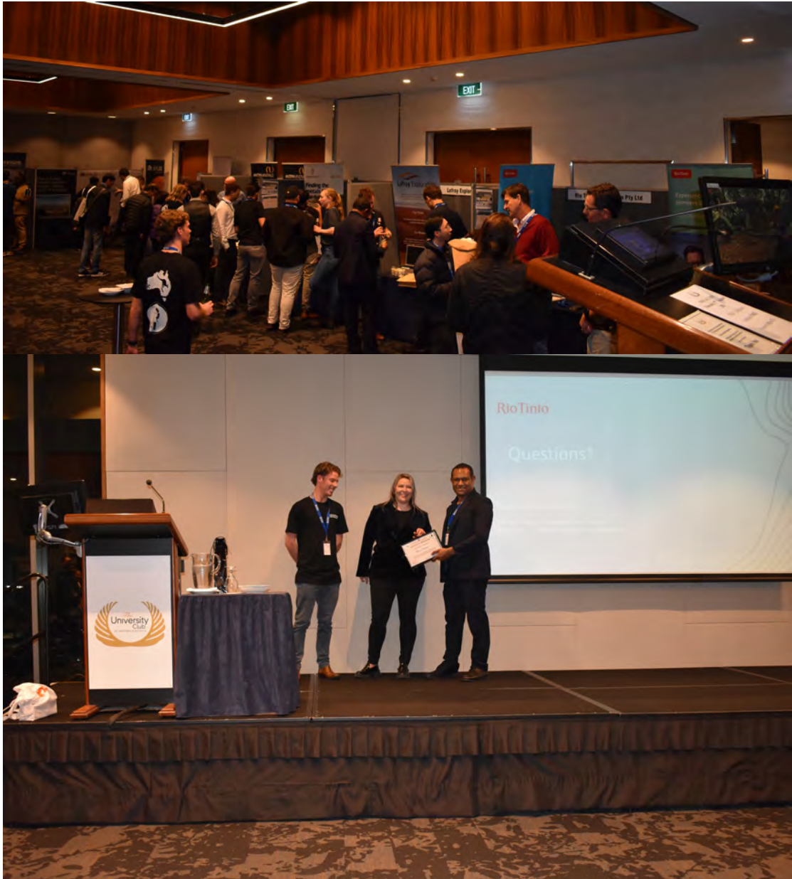
Photos from the Student-Industry Networking Night, 17 th Aug 2023, organised by the SEG-SGA Student Chapter, in collaboration with the Woolnough Society. 16 major mining and exploration companies in Western Australia turned up to support the event, which was attended by more than 100 students.