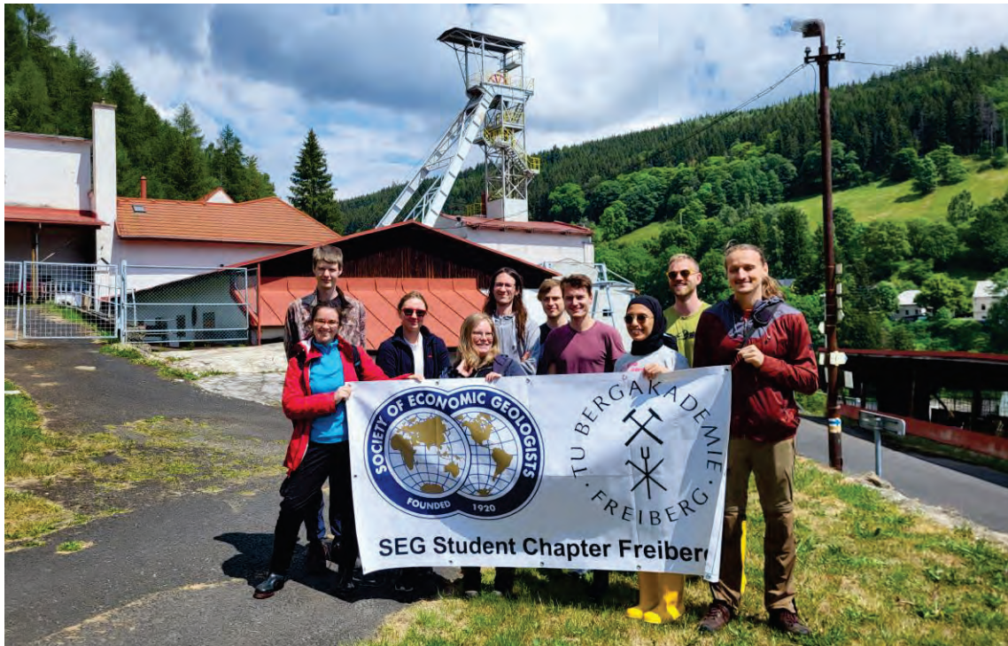
Figure 3: SEG SC Freiberg members and students from the SGA Prague and SEG Brno Student Chapters in front of the Svornost shaft from the Jáchymov mine, Czech Republic.