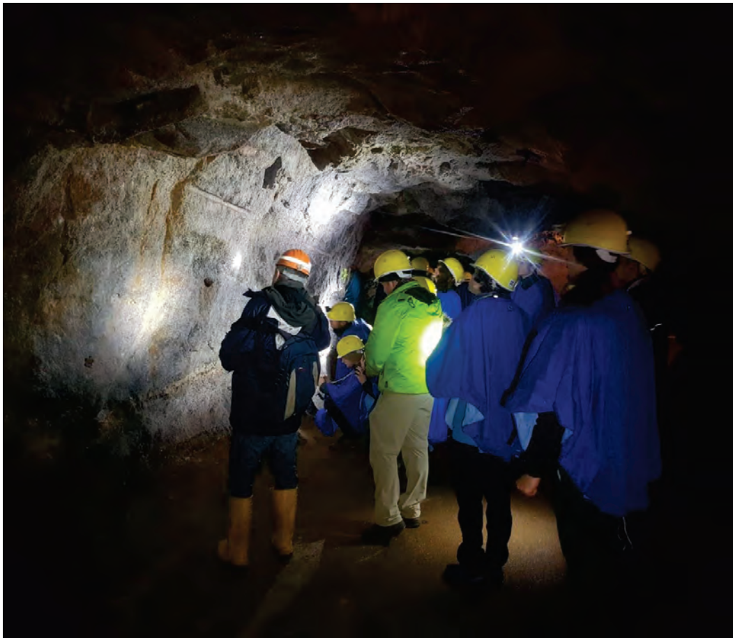
Figure 1: SEG SC Freiberg members and Prague students in the underground Zinnwald mine.