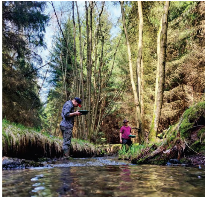
Figure 2: SEG SC Freiberg members prospecting for heavy minerals in the creek.