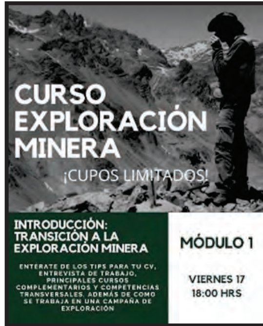
Figure 2: Promotional poster of workshop: “Desde la Universidad hasta el primer trabajo” imparted by geologist Enrique Crisostomo.