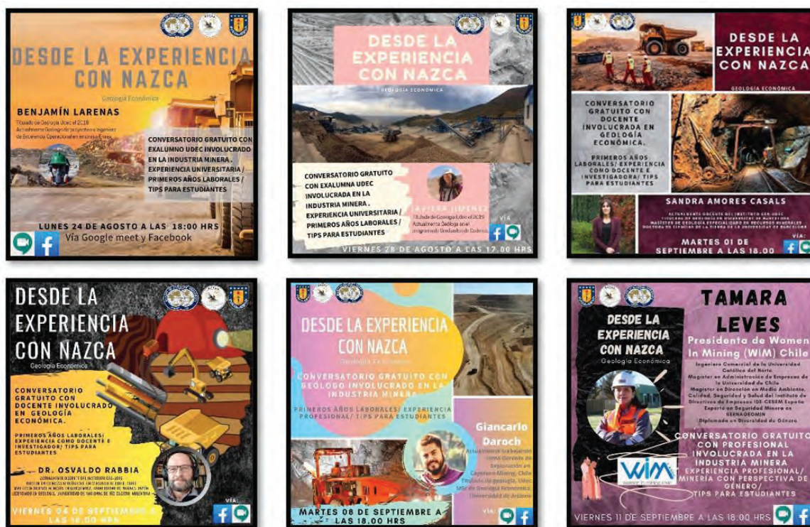
Figure 3: Promotional posters of conversatory: "Desde la experiencia con Nazca".

The conversatory it was disseminated by social networks and had the presence of geology students from various universities nationwide. This activity was an excellent opportunity to clear up doubts about the world of work and to share with people in the industry in a closer way.