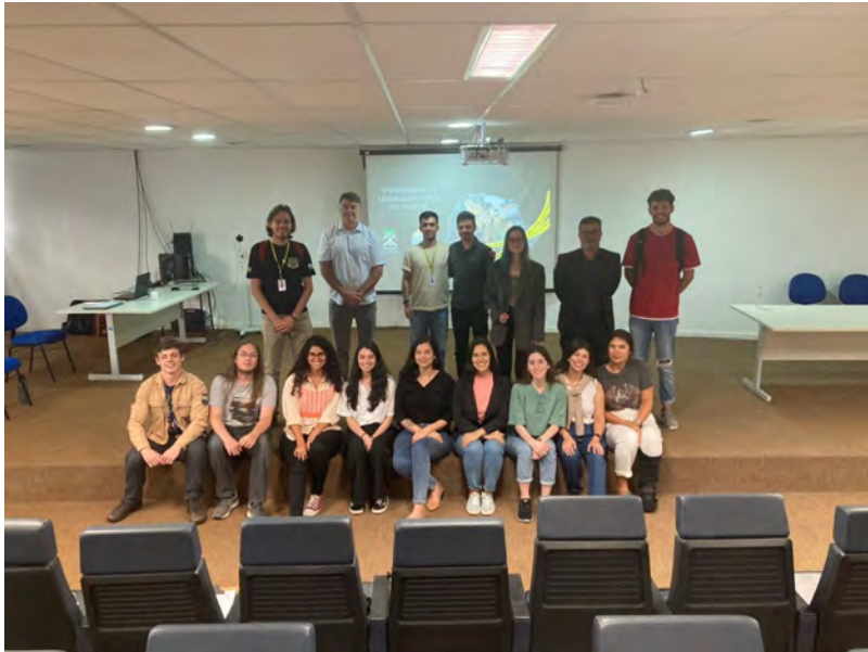
Figure 2: Lecturers and organizers of the event in the Universidade Federal do Paraná.