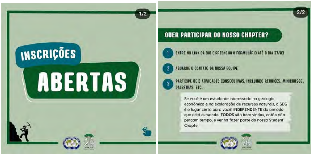
Figure 9: Instagram post advertising the selection process 2023/1.

This year the SEG UFPR Student Chapter organized two selection processes to accept new members. Notice 2023/1 was open from March 21st until March 27th and included the entry of 11 volunteer members and notice 2023/2 was open from August 7th until August 18th and included the entry of 13 volunteer members.