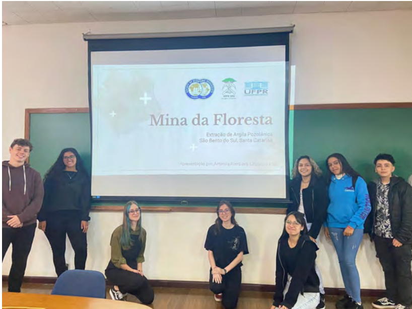
Figure 5: Presentation about local sites of interest.

known about the geologic setting and specific information about one of the aforementioned sites. The presentations were held in-person and online through Google Meet.