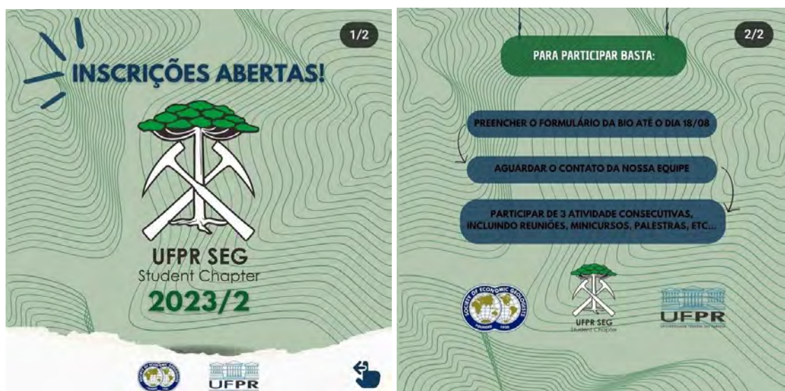
Figure 10: Instagram post advertising the selection process 2023/2.