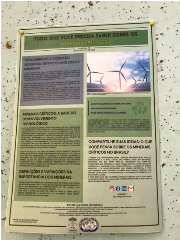
Figura 8: Newsletter hung on Universidade Federal do Paraná.