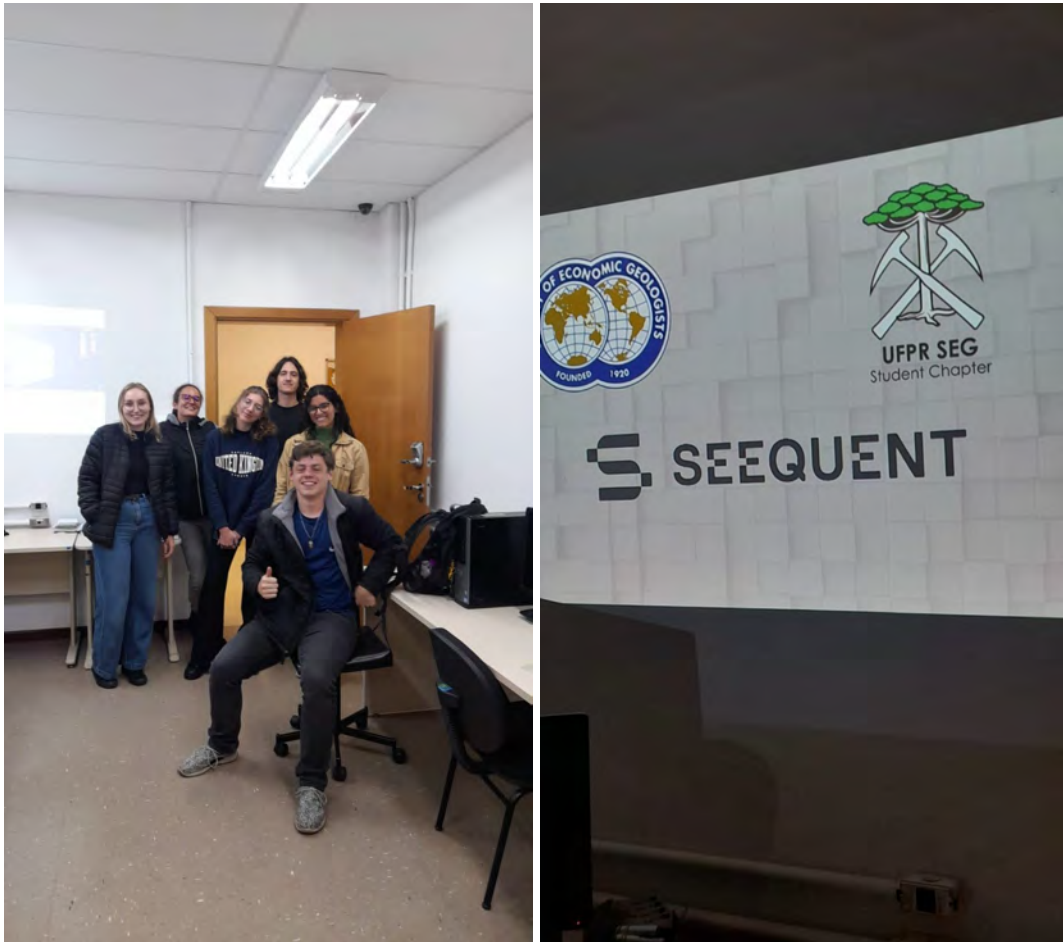
Figure 7: Tutors and attendees of the course.

access to a computer and a temporary Leapfrog license with a dataset example, which was worked into a geologic 3D model during the course.